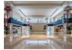
1st Floor Arrival Lobby