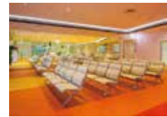
2nd Floor Departure Lounge

2nd Floor Departure Lobby Observation Deck